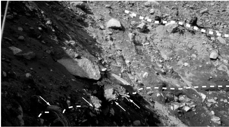
Figure 2. Dated logs (arrows; A.D. 540–770) and paleosol (thin dashed line; A.D. 420–620) buried by till during first millennium A.D. glacier advance at Lillooet Glacier in southern Coast Mountains (Reyes and Clague, 2004). Thick dashed line marks wood layer and paleosol developed on first millennium A.D. till that was buried during Little Ice Age glacier advance. Buried surfaces are separated by 4–6 m of vertical distance.

trital and/or in situ wood and commonly associated with a paleosol is covered by glacial sediments dating to the first millennium A.D. (Fig. 2). A similar buried surface typically separates these glacial sediments from overlying Little Ice Age till or outwash.