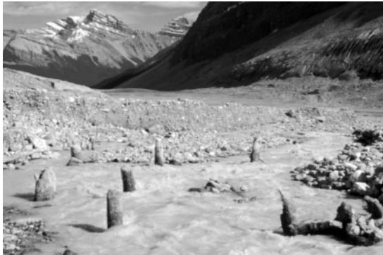
Figure 2. Sheared stumps in growth position protruding from an ice proximal meltwater channel along the northern terminus of the Saskatchewan Glacier in September, 1999. Radiocarbon dates of 2,830 \pm 60 (Beta 135586) and 2,870 \pm 60 (Beta 135587) ^{14}\text{C} years B.P. were obtained from the perimeter of two of the stumps.

including a significant mid-19th Century advance and a less extensive event during the early and middle parts of the 18th Century (Figure 2). Evidence for pre-LIA events comes from detrital wood found on ice proximal outwash deposits at various times over the last two decades (Luckman et al. 1993, 1994). The oldest samples date between 3,200 to 2,500 ^{14}\text{C} years B.P. (Table 1) and provide circumstantial evidence for an advance equivalent to the Neoglacial Peyto Advance (Osborn and Luckman 1988; Luckman et al. 1993; Luckman 1993, 1996).